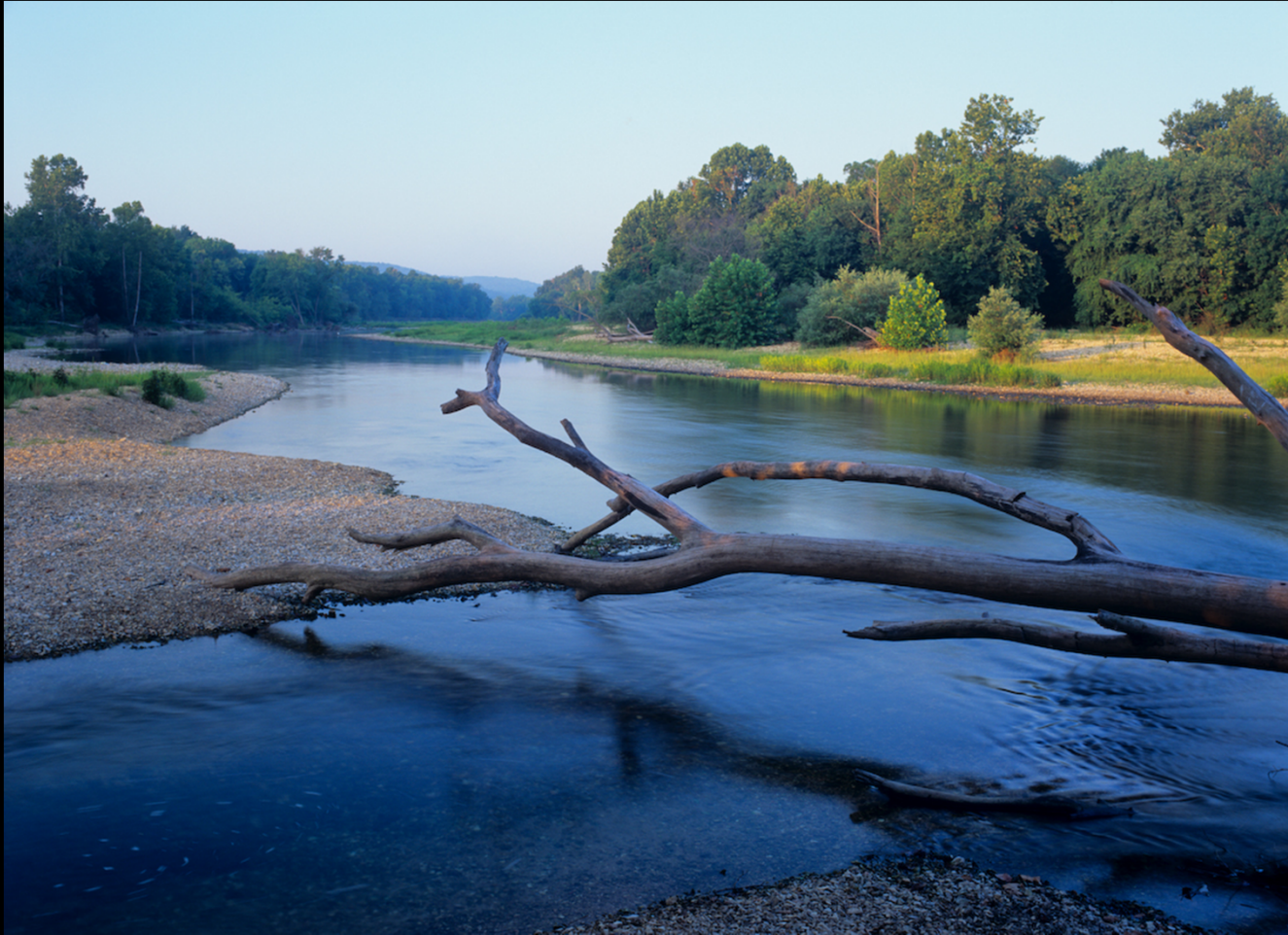
Confluence of Barren Fork and Illinois River