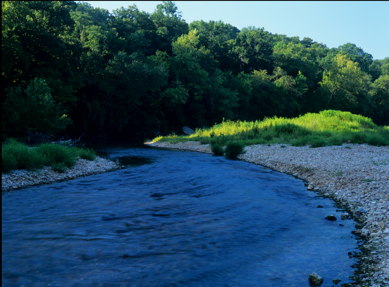
Barren Fork River