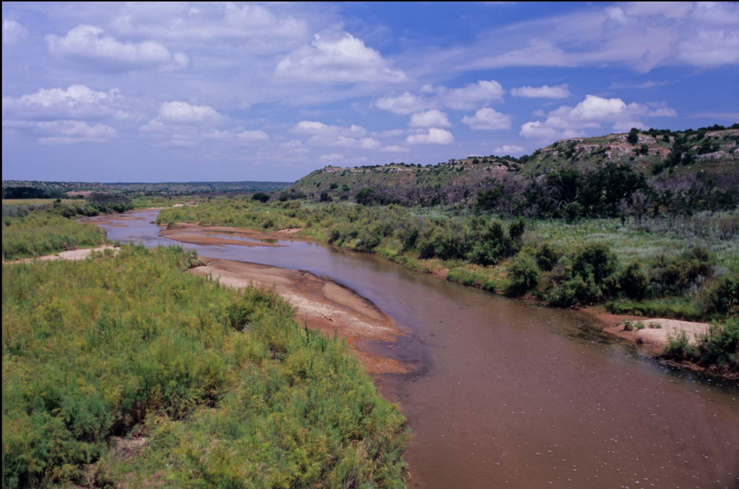
North Fork of the Red River