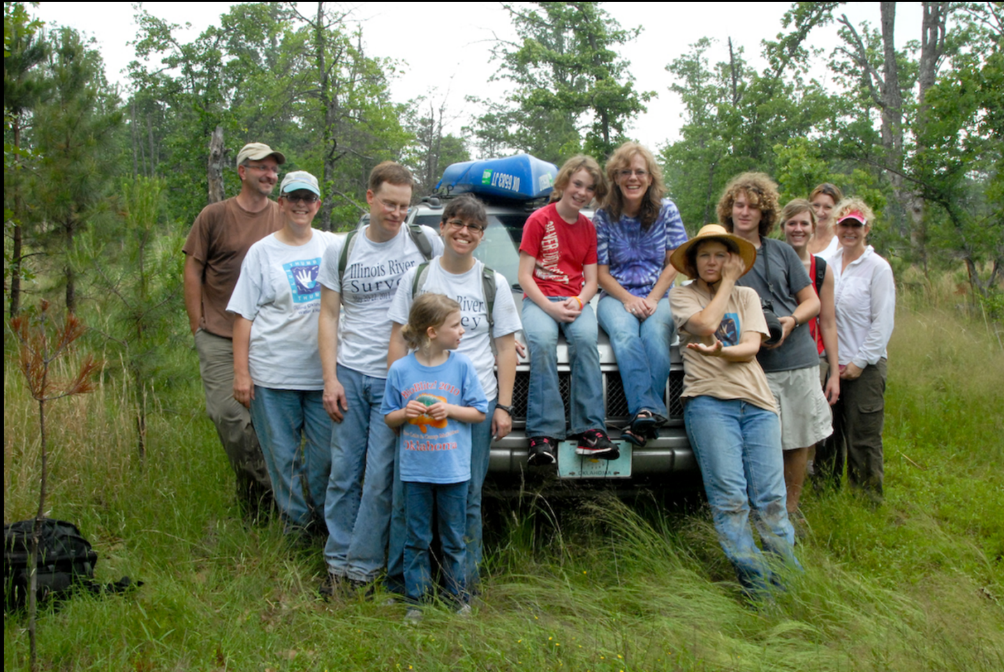
Hike on Nichols Preserve