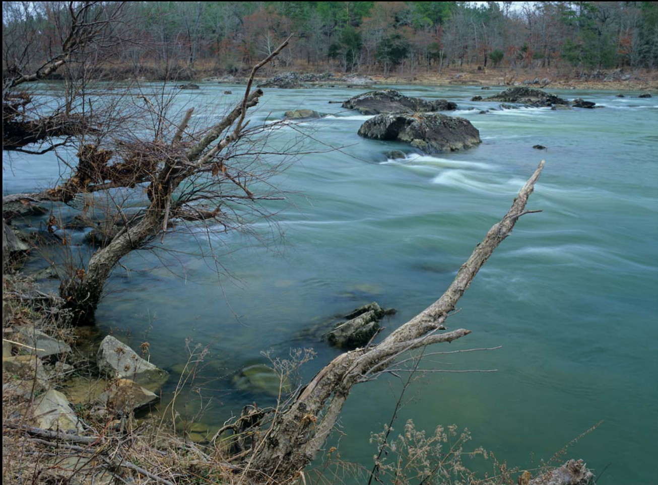
Upper Mountain Fork River