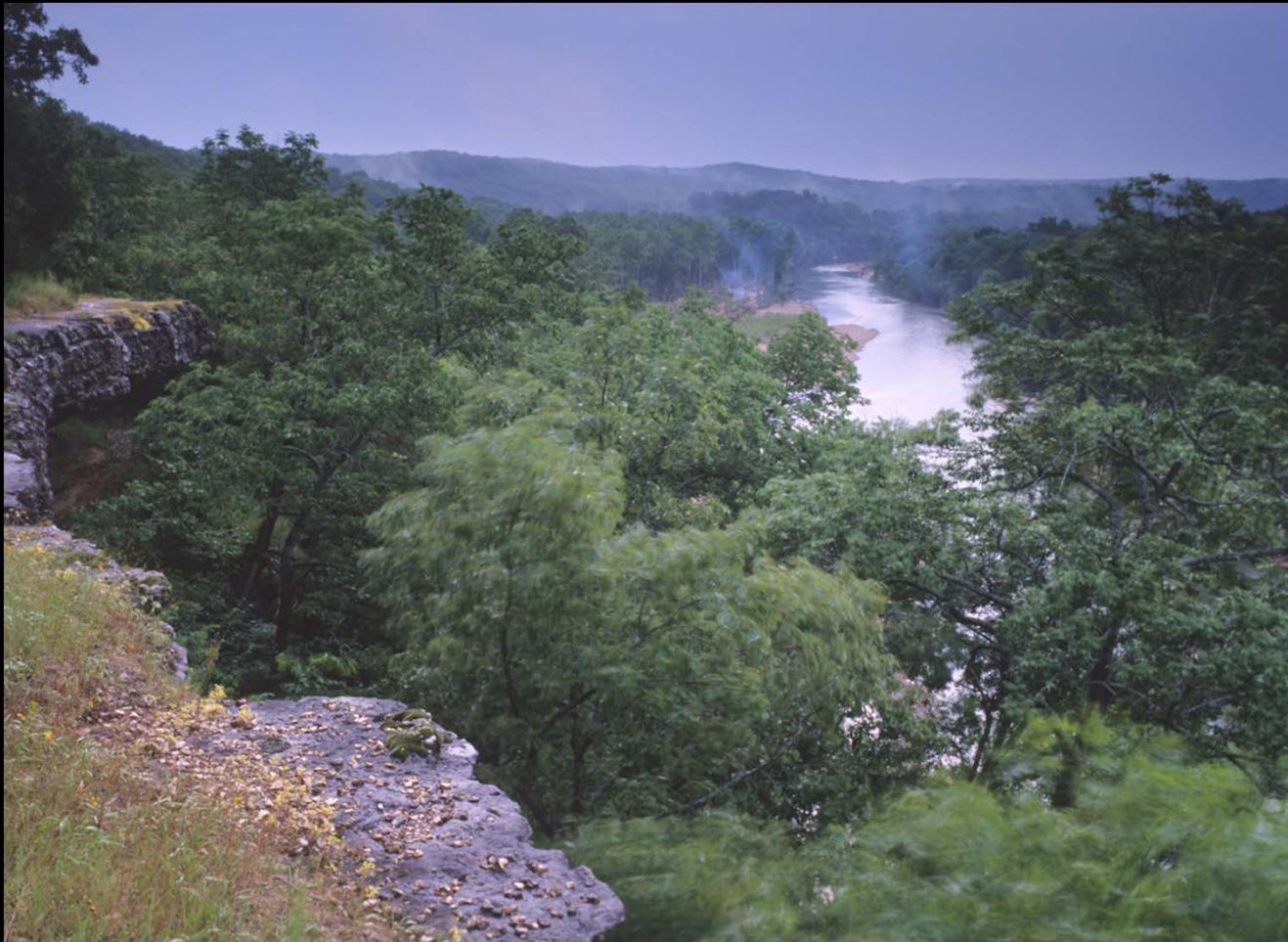
Illinois River from Goat's Bluff