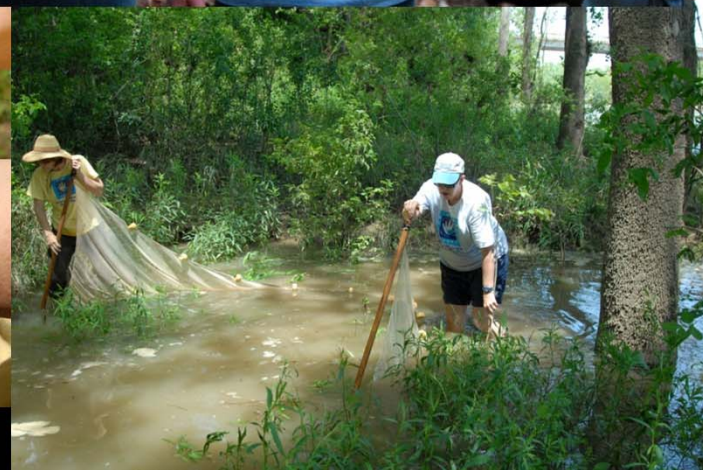
Illinois River Survey