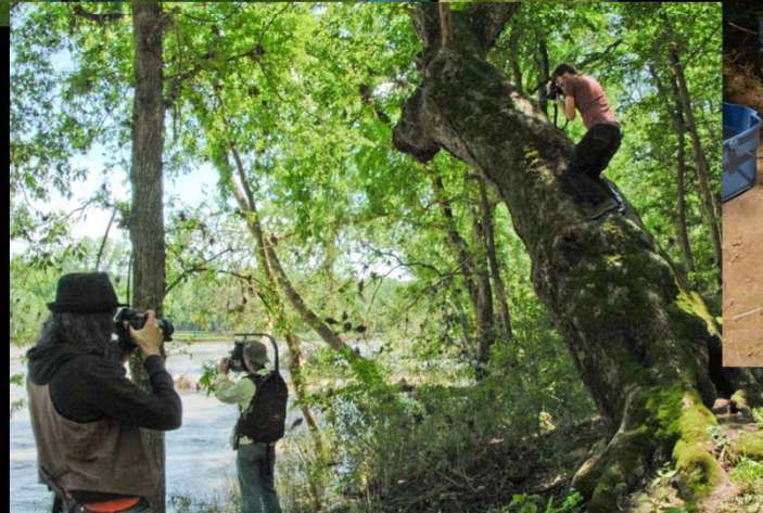
Filming of the Earth Chronicles Project