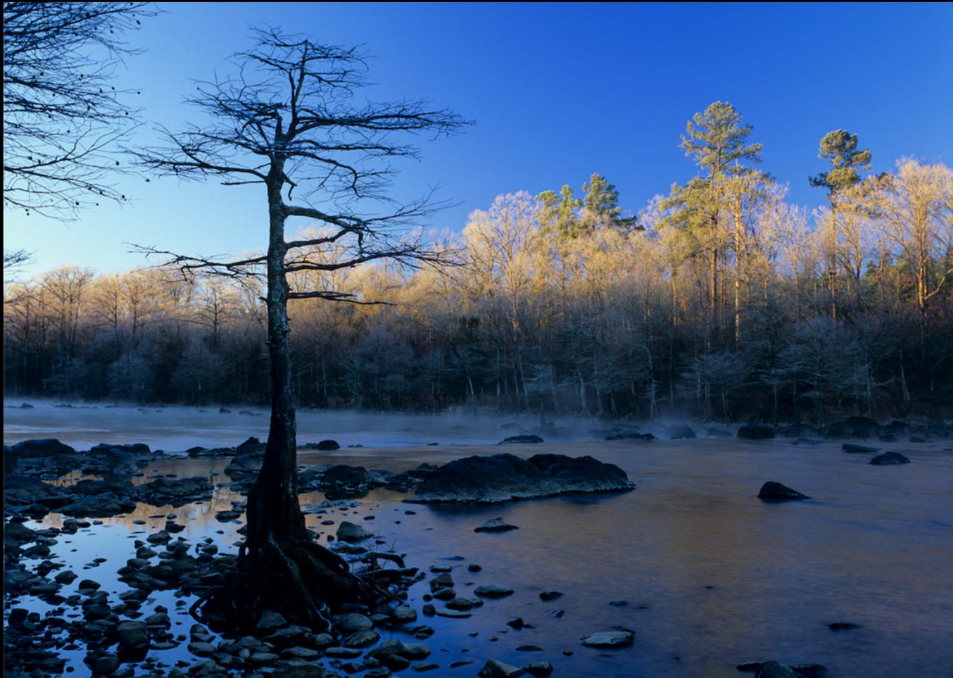
Lower Mountain Fork River