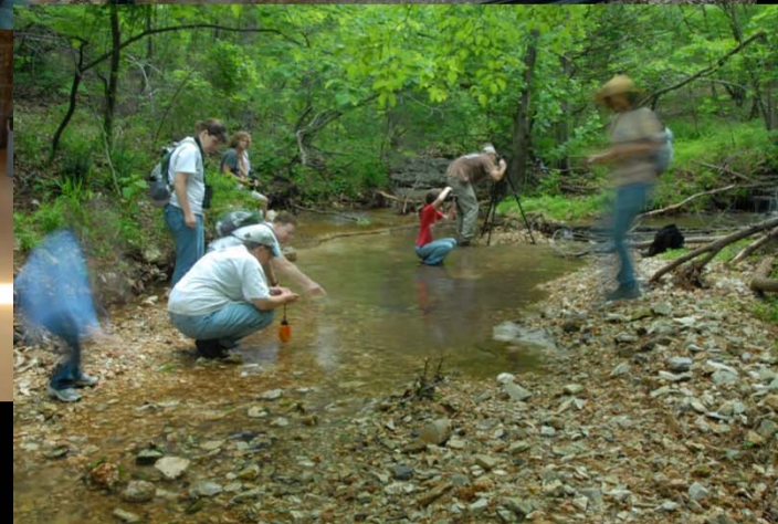
Illinois River Survey