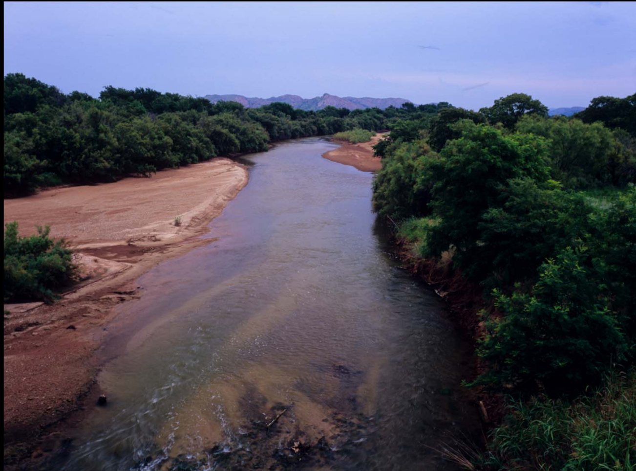
Elm Fork of the Red River